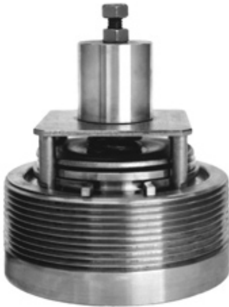
• MBPV Threaded Style

Meridian's Back Pressure Valve (MBPV) is available in a NPT threaded configuration from 1" to 4", or a wafer style carrier that fits between flanges in sizes 2" to 4" in all pressure classes (RF, RTJ, or RFxRTJ).